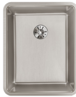
ELUHH1418TPD 16-1/2" x 20-1/2" x 9" Min. cabinet size: 21"