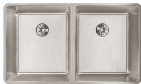
ELUHH3118TPD 32-3/4" x 19-1/2" x 9" Min. cabinet size: 36"