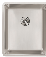
ELUHH1316TPD 16" x 18-1/2" x 8" Min. cabinet size: 21"