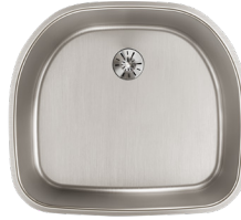
ELUHH2118TPD 23-5/8" x 21-1/4" x 9" Min. cabinet size: 30"