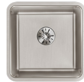
ELUHH1212TPD 14-1/2" x 14-1/2" x 7" Min. cabinet size: 21"