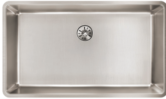
ELUHH3017TPD 32-1/2" x 19-1/2" x 9" Min. cabinet size: 36"