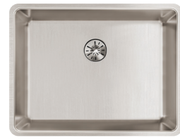
ELUHH2115TPD 23-1/2" x 18-1/4" x 9" Min. cabinet size: 27"