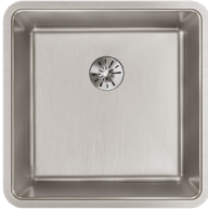
ELUHH1616TPD 18-1/2" x 18-1/2" x 9" Min. cabinet size: 21"