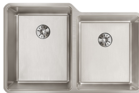
ELUHH3120RTPD 31-1/4" x 20-1/2" x 9" Min. cabinet size: 36"